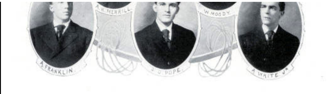
Alpha Rho Chapter, 1907.

The Alabama - Alpha Rho chapter was driven from the national in the 1913 purge, (like all chapters that kept their integrity), and has been independent ever since.